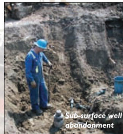
Sub-surface well abandonment