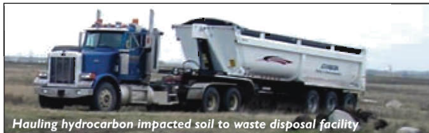
Hauling hydrocarbon impacted soil to waste disposal facility

Gypsum, fertilizer, storage tanks, Sphag-sorb and Alfalfa Green round out the inventory of environmental products the department handles.