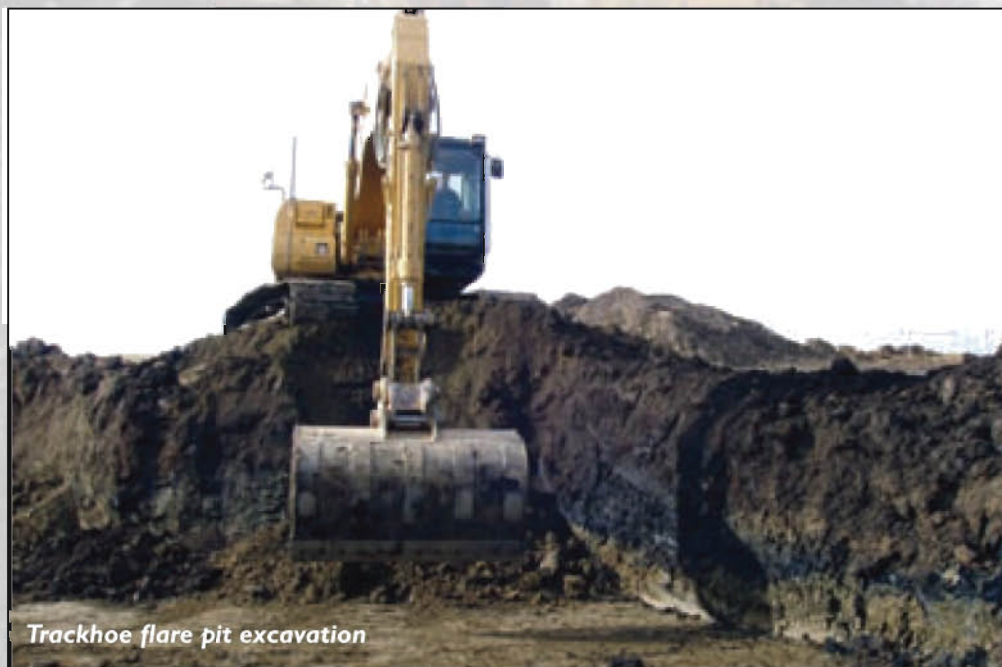
Trackhoe flare pit excavation

As well, the equipment inventory contains a manure spreader, fertilizer spreader, rock picker, ATV with mounted grass seeder, and drill seeder, solar panels with submersible pumps, and a laser level and transit.