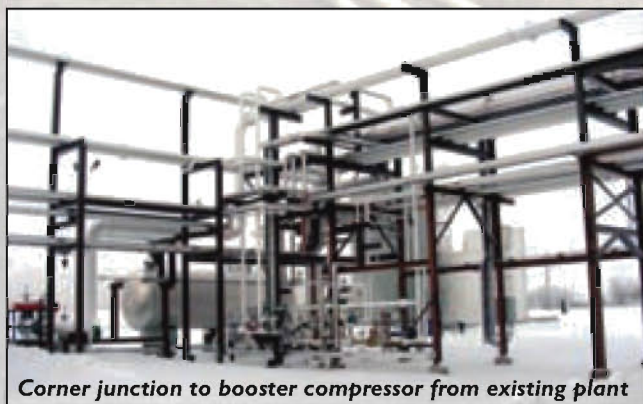
Corner junction to booster compressor from existing plant