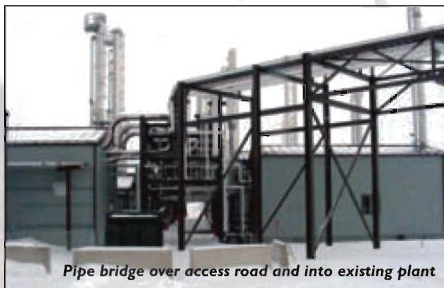
Pipe bridge over access road and into existing plant

Although the Company had done this type of work for several years prior, a separate division dedicated solely to facility requirements in the water and oil & gas industries was introduced in June of 2008, when the company joined forces with Top-Kick Oilfield Maintenance. Key personnel with industry experience were engaged in order to provide clients with the service and quality they expect from CES.