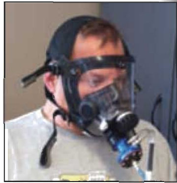
Breathing apparatus (H 2 S Alive course)

Courses can be held in one of our locations, or at a location of a client's choice.