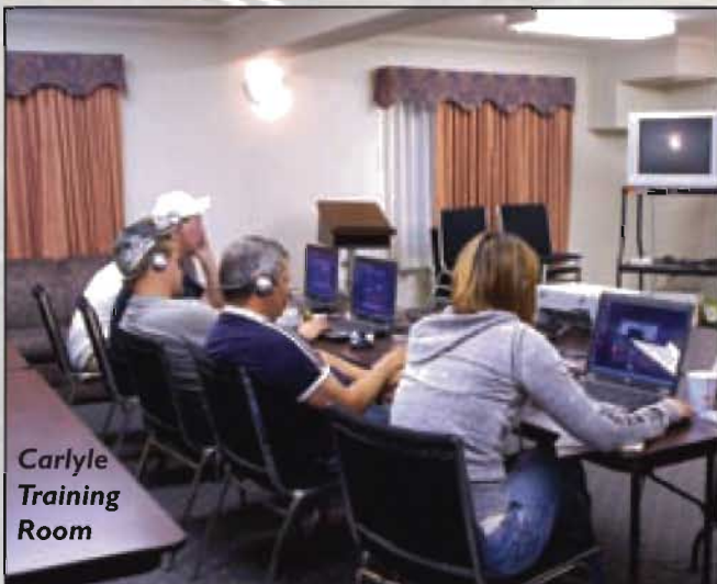
Carlyle Training Room

For instance, CES recently made the memorable and unprecedented 4 million man-hours LTA free. The Company has also received recognition in Alberta (Enform – Partnerships in Injury Reduction), Saskatchewan (Heavy Construction Safety Association of Saskatchewan) and Manitoba (Manitoba Heavy Construction Safety Program). In an industry in which safety is of the utmost importance for contractors, clients and employees, CES has provided a sharp focus and clear vision on the wellbeing of every person on its jobsites.