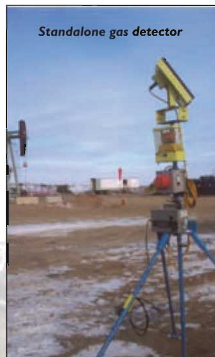
Standalone gas detector