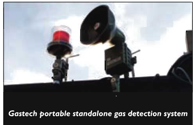
Gastech portable standalone gas detection system

Carson Safety Sales & Services is an authorized distributor for BW Technologies, Thermo Fischer Scientific (Gastech), 3M Canada, and Net Safety Monitoring Inc.