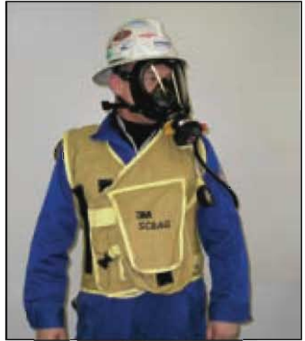
Above: Self Contained Breathing Apparatus

Further, additional equipment may be added to meet special requirements.