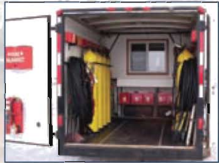
Below: interior of safety trailer

To discuss how Carson Energy Services can play an integral role in your upcoming projects, please contact one of our staff members below: