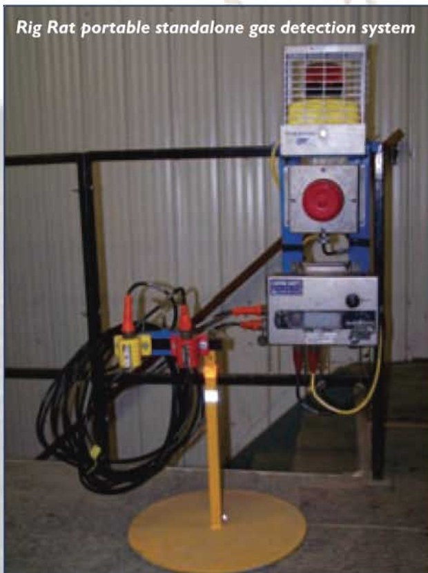
Rig Rat portable standalone gas detection system

We offer the following products to our valued clientele: