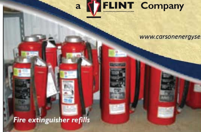
Fire extinguisher refills