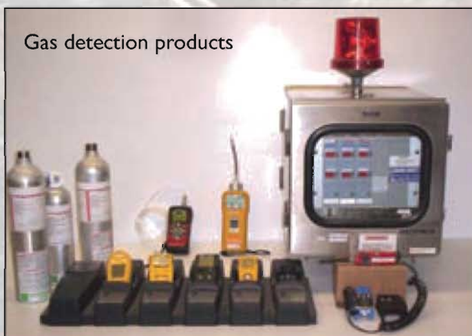
Gas detection products

As well as being an authorized distributor of Self Contained Breathing Apparatus (SCBA, SCBAG, SABA and portable air systems) with 3M, Scott and Survivair, Carson Safety Sales & Service has air purification panels and monitors, and access to industrial, rescue and NFPA units, and high and low pressure Cascade air cylinders. All our technicians are fully trained and certified. Breathing air equipment is available either through sale or rental.